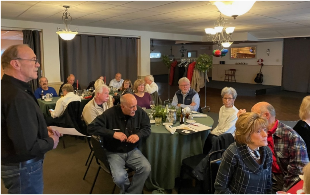
Monthly Meeting at Fosters Coach house